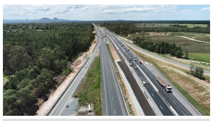
Realigned northbound and southbound traffic looking north from Pumicestone Road