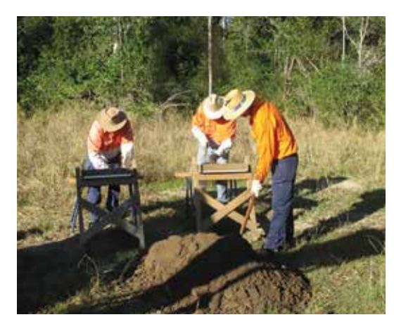
Test pitting was undertaken at many sites along the 26km new highway corridor as part of cultural heritage investigations.

The Department of Transport and Main Roads (TMR) recognises the significance of different cultures and the importance of managing Indigenous, historical, shared and natural heritage. Several archaeological, anthropological, ground penetrating radar surveys, cultural heritage surveys and investigations were undertaken to inform the development of a Cultural Heritage Management Plan for the project. This includes surveys by the Registered Native Title Group.