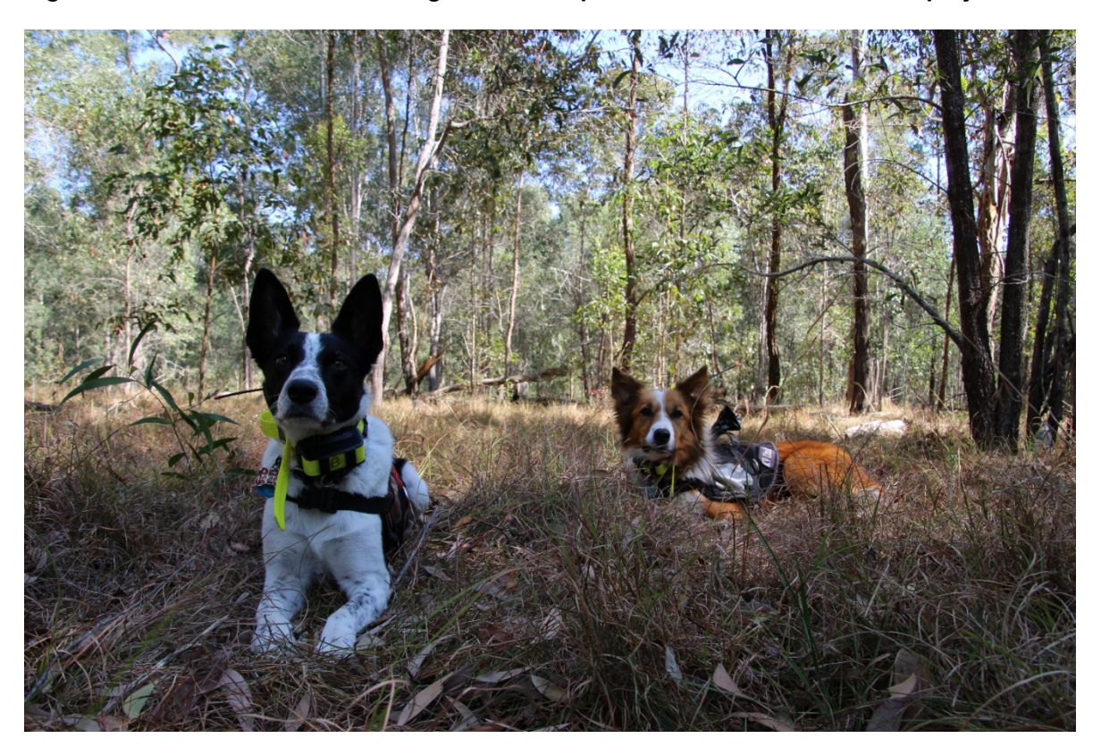
Figure 4 Koala scat detection dogs trained as part of the Section C research project