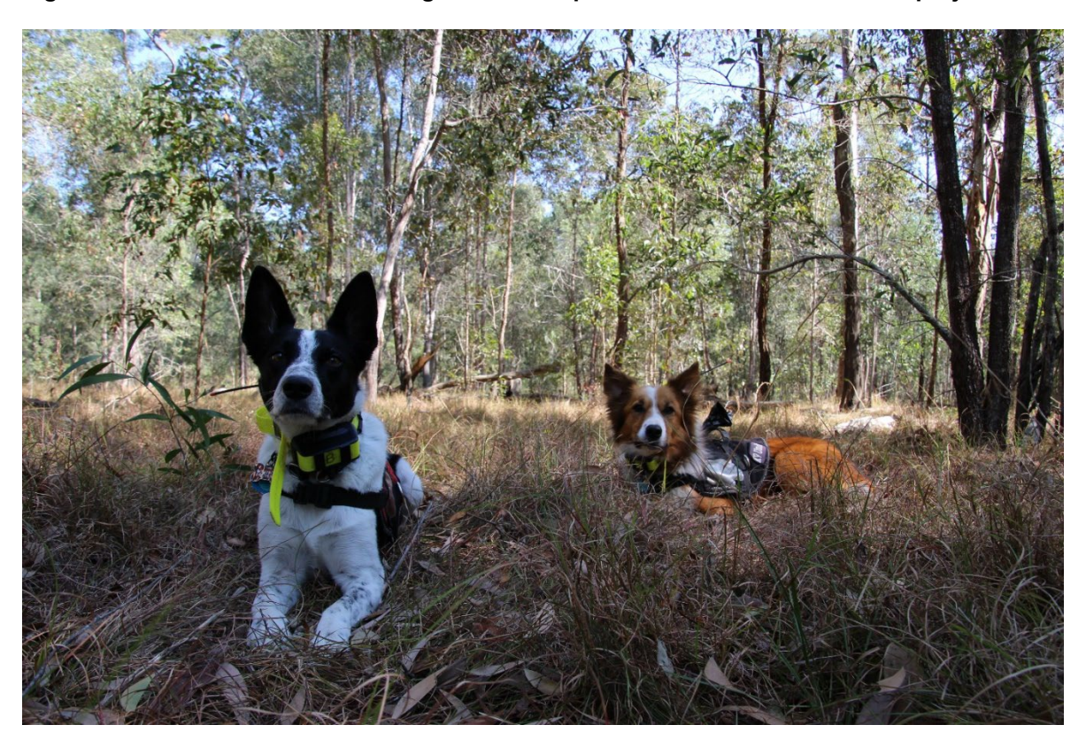
Figure 4 Koala scat detection dogs trained as part of the Section C research project