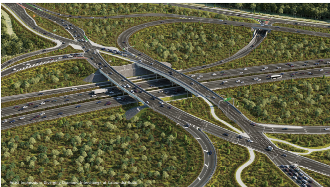
Artist impression: Diverging Diamond Interchange at Caloundra