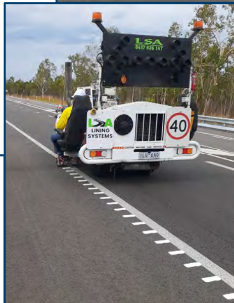
Pictured: audible linemarking has been laid on the highway edges, to alert motorists when travelling out of their lane (left).