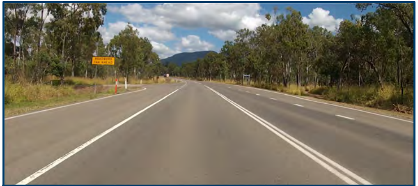
Pictured: the Bruce Highway intersection with Cromarty Siding Road prior to the project commencing (above) and as construction was completed (below).

We appreciate the impact that these types of road upgrades have on residents. We greatly appreciate your understanding throughout these works.