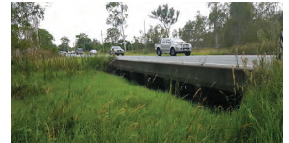
King Johns Creek – existing culverts have low flood immunity