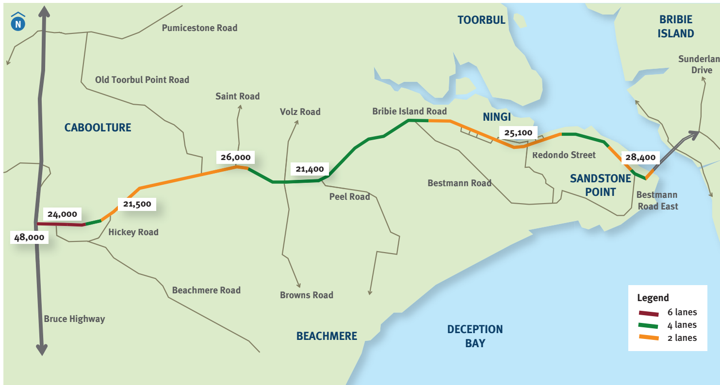
Figure 2. Traffic Volumes and Existing Lane Configuration

Closures generally occur in the vicinity of King Johns Creek (between Hickey Road and Old Toorbul Point Road). Between 2011 and 2015, a least five recorded road closures have occurred – four of these in excess of 15 hours and two that lasted longer than 40 hours. This impacts on reliability, isolates Bribie Island and coastal communities and increases travel times during minor flooding events.