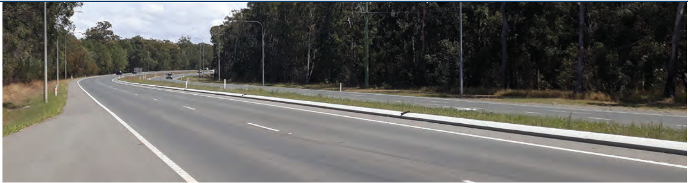
An existing 4-lane median divided section of Bribie Island Road