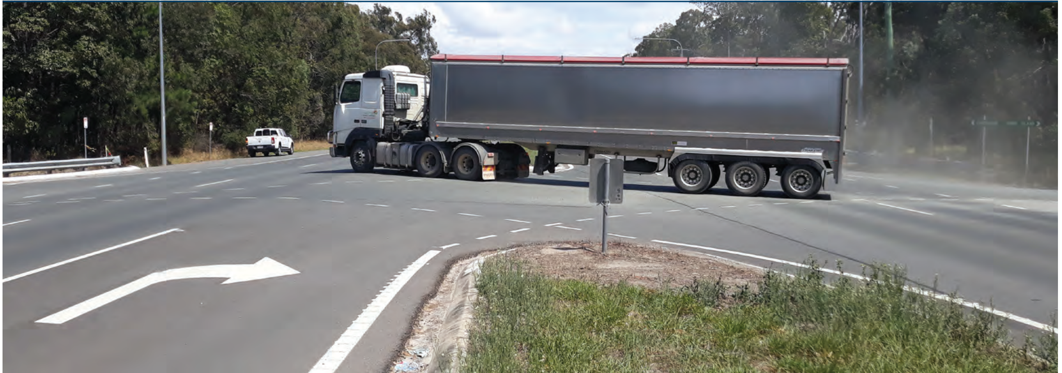
Heavy vehicle turning out of a 'Give Way' controlled side street in 100 km/h section of Bribie Island Road.