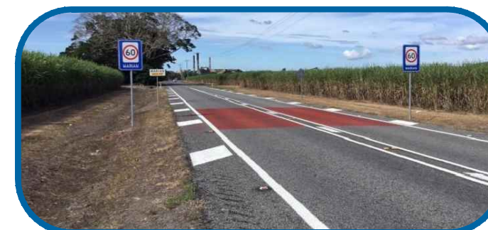
Example of Township Entry Treatment line-marking, exact location to be confirmed