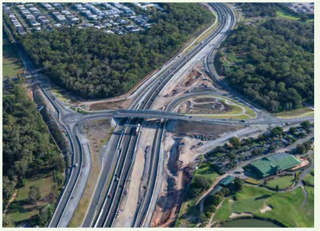
The new Nudgee Road bridge