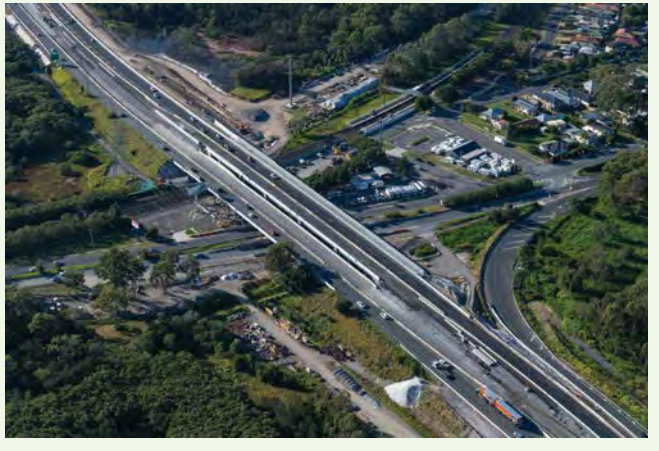
The upgraded Sandgate Road bridge