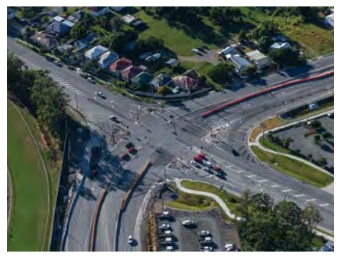
Depot Road/Braun Street/Board Street intersection upgrade is due for completion in late 2018.

Work is continuing to upgrade Depot Road from two to four lanes between Braun Street and the Gateway Motorway ramps. The final stage of work in this area has commenced, with a number of traffic changes already in place, including two westbound lanes now operating and a new signalised intersection at the entrance of Sandgate District State High School.