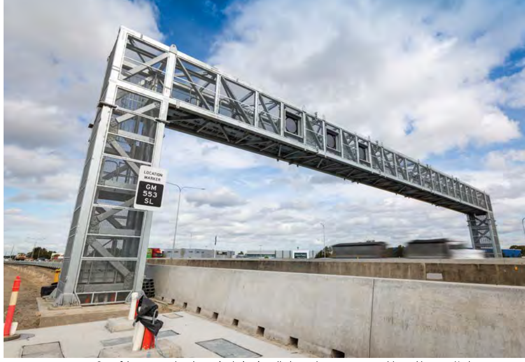
One of the new overhead gantries being installed over the motorway southbound lanes at Nudgee.