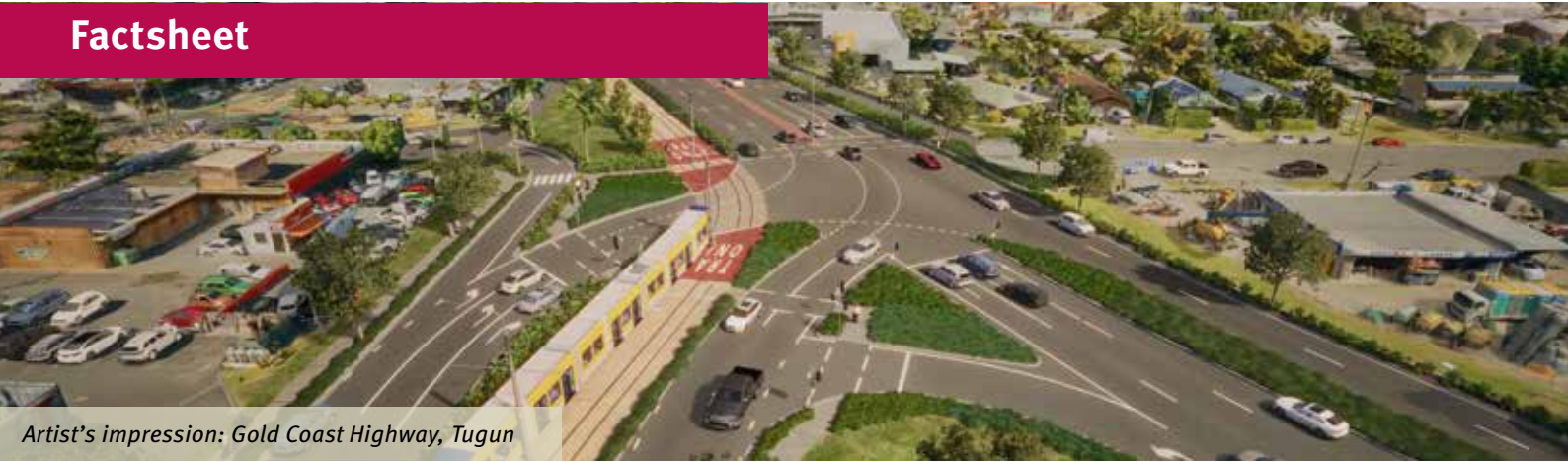
Artist's impression: Gold Coast Highway, Tugun

Gold Coast Light Rail Stage 4 will deliver a 13km extension south of the Gold Coast Light Rail Stage 3, linking Burleigh Heads to Coolangatta, via the Gold Coast Airport. The Queensland Government has committed $1.5 million to undertake the Gold Coast Highway (Tugun to Coolangatta) Multi-modal Corridor Study . A further $5 million jointly funded by Queensland Government and City of Gold Coast has been committed to undertake a Preliminary Business Case for Gold Coast Light Rail Stage 4 from Burleigh Heads to Coolangatta, via the Gold Coast Airport.