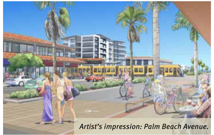
Artist's impression: Palm Beach Avenue.