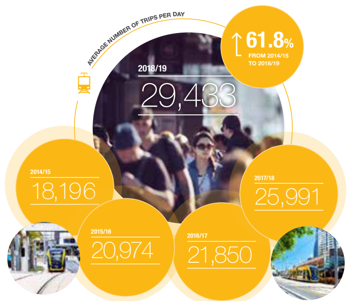
(Source: City of Gold Coast, Light Rail Corridor 2019 Status Report ).