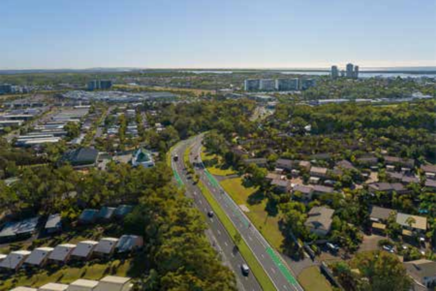
Artist's Impression: Olsen Avenue northbound to Harbourtown Shopping Precinct.