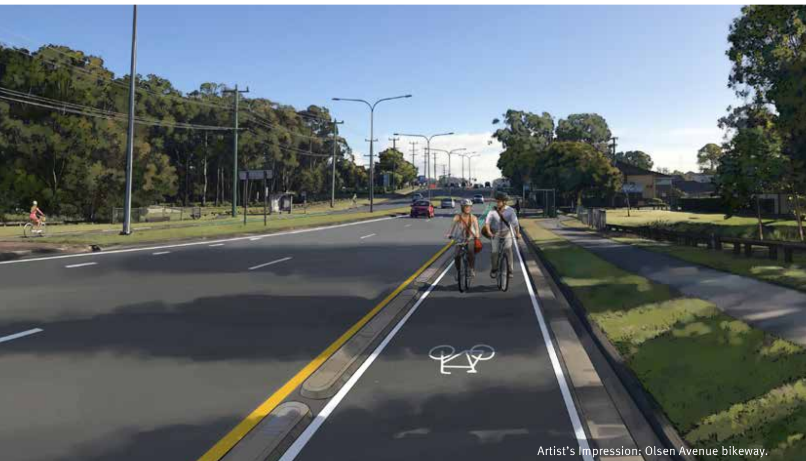
Artist's Impression: Olsen Avenue bikeway.