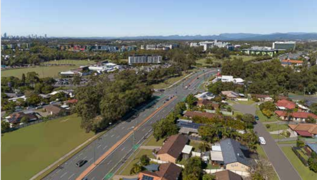
Artist's Impression: Olsen Avenue southbound to Gold Coast Hospital and Griffith University.