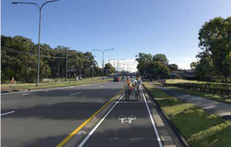
Artist's Impression: Bikeway on Olsen Avenue.