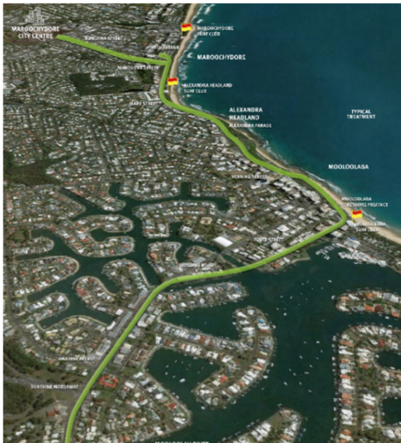
M2M cycleway proposed alignment (concept only)

Once complete, the six kilometre-long, three-metre-wide cycleway will provide a safe off-road connection from the Sunshine Motorway near the Mooloolah River, through Mooloolaba to the new cycleway infrastructure in Maroochydore City Centre at Maud Street in Maroochydore, for all active transport users.