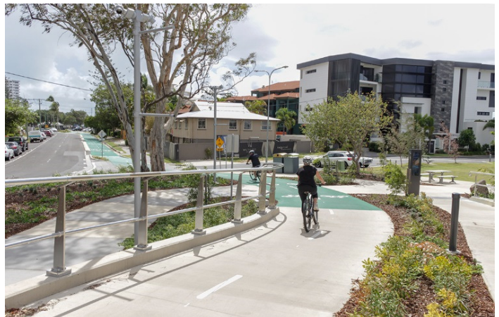
Mooloolaba Walk and Ride Bridge, Mooloolaba

A variety of feedback tools were used to capture feedback, with the most popular tool being Social Pinpoint, an online interactive mapping platform. Other feedback methods included contacting the project team by email, phone, or completing a postcard / feedback form.