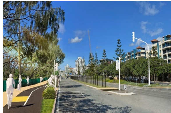
Image: Artist impressions of the preferred design option presented in May–July 2020