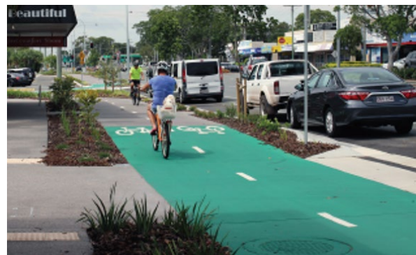
Image: Typical cycleway treatment for the proposed preferred option (Stage 2 shown)