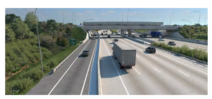
Realigned and lengthened southbound off-ramp.