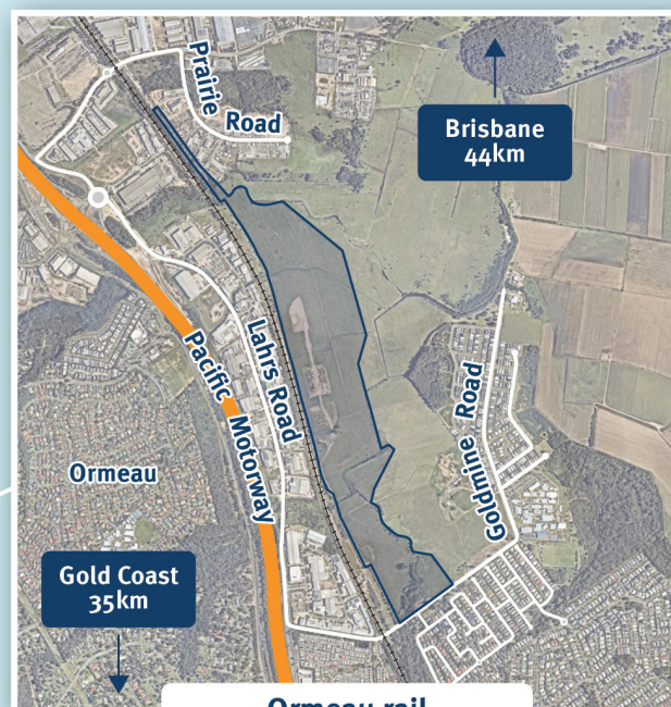
Ormeau rail facility site