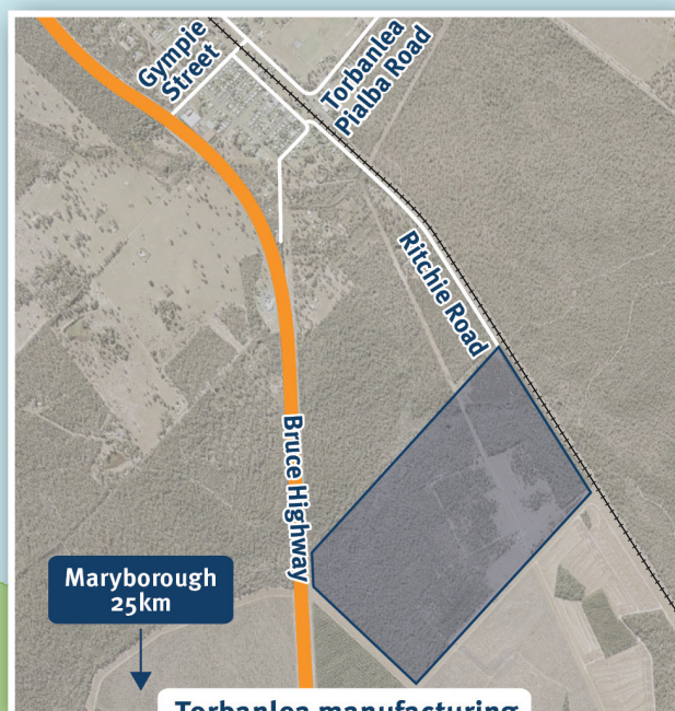
Torbanlea manufacturing facility site