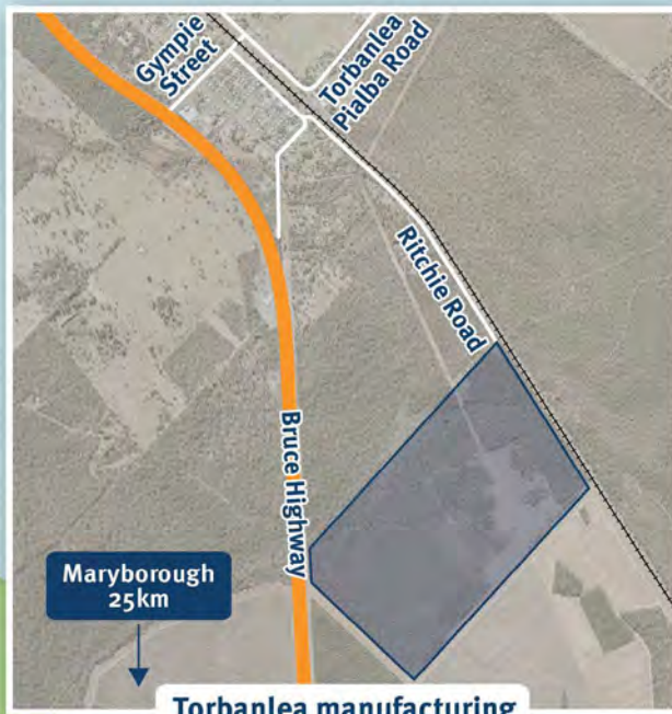
Torbanlea manufacturing facility site