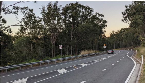
Eatons Crossing Road next to Bunya Road

Package B investigations to improve road safety between Cedar Creek, Draper and just north of Serendipity Drive, Samford Valley, began in April 2021. Improving safety for turning vehicles at intersections within Package B is also a priority. TMR is investigating options to improve safety at a number of intersections. Other improvements being investigated as part of Package B include wide centre line treatments, wider sealed shoulders, road lighting at intersections, safety barrier installation and roadside hazard removal. Pavement and soil condition data from geotechnical investigations will be used to inform the design process. Constructability will also be considered based on the surrounding environment.