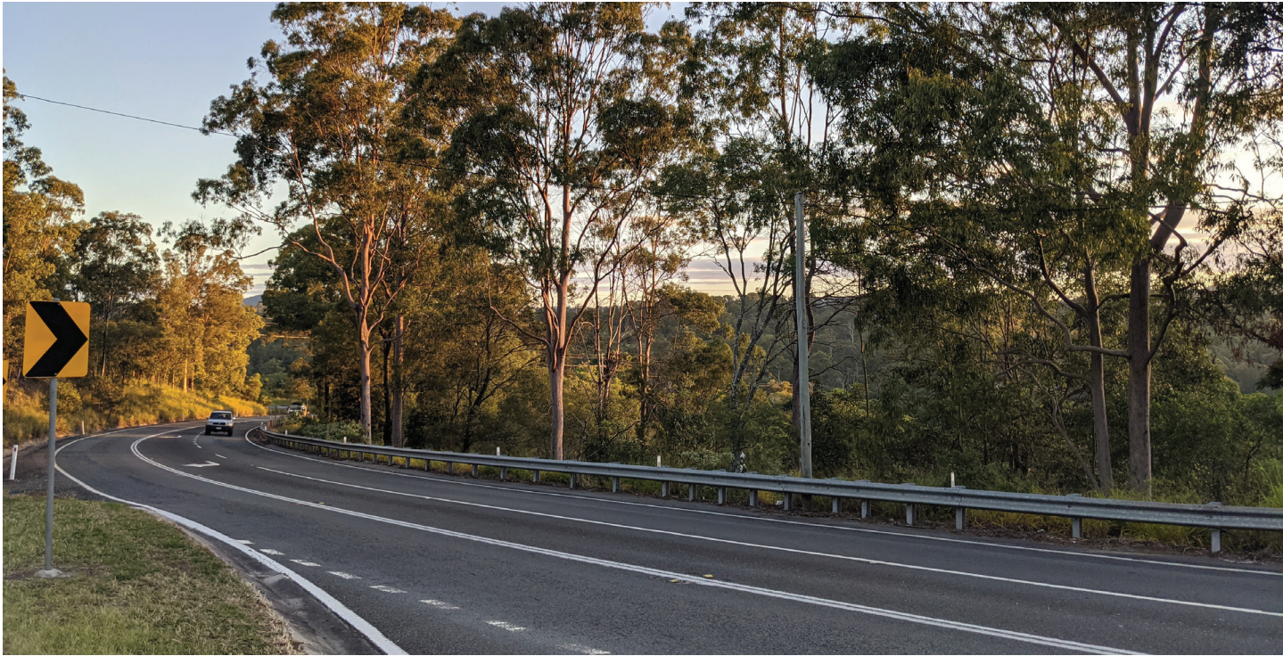
Eatons Crossing Road next to Rotheadon Drive

Package B investigations to improve road safety between Cedar Creek, Draper and just north of Serendipity Drive, Samford Valley, began in April 2021. Improving safety for turning vehicles at intersections within Package B is also a priority. TMR is investigating options to improve safety at a number of intersections. Other improvements being investigated as part of Package B include wide centre line treatments, wider sealed shoulders, road lighting at intersections, safety barrier installation and roadside hazard removal. Pavement and soil condition data from geotechnical investigations will be used to inform the design process. Constructability will also be considered based on the surrounding environment.