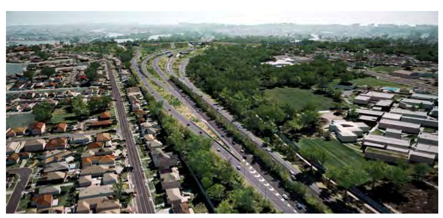
Artist's impression: Sunshine Motorway leading to the Mooloolah River Interchange (looking south towards Birtinya)