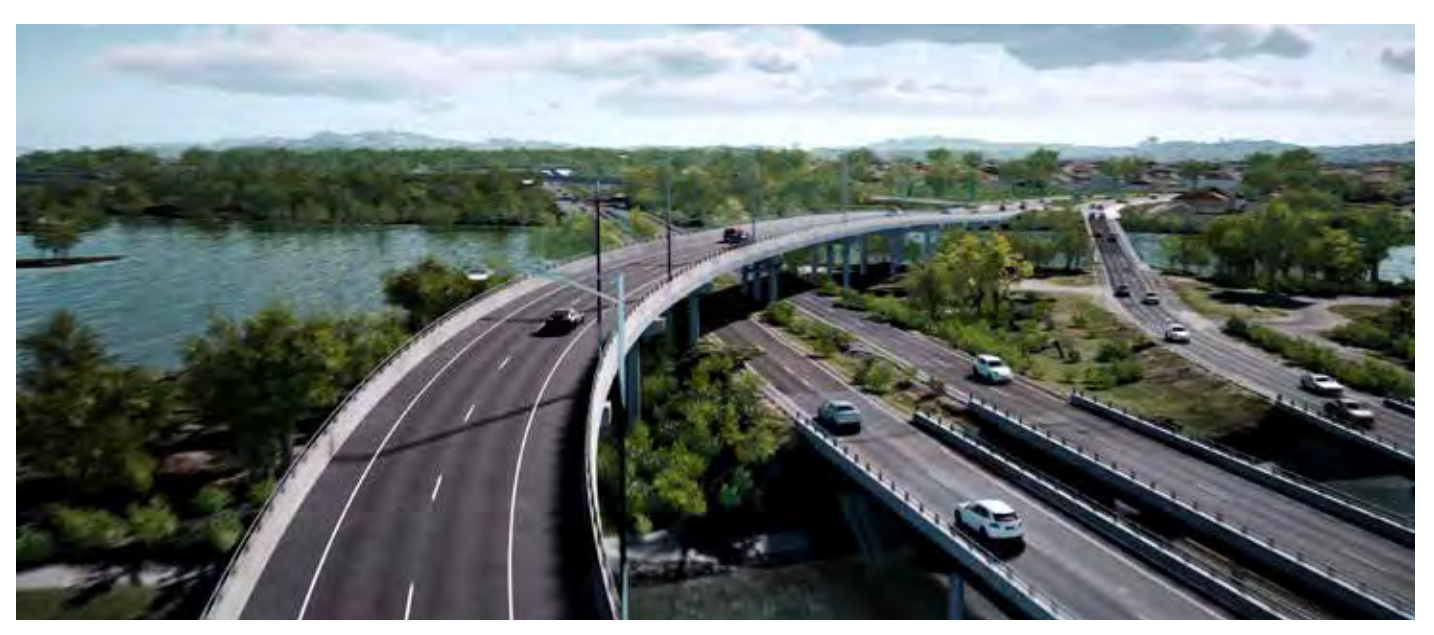
Artist's impression: New overpass connecting Nicklin Way northbound with Brisbane Road in Mooloolaba (Mooloolaba to the right)

The completion of the detailed business case is a critical step in confirming the cost and benefits of the MRI to support funding applications to the Australian Government. With joint funding allocated by the Queensland Government and Australian Government, the project will progress to detailed design and construction. TMR is seeking community feedback on the planning layout, which will be considered as part of the detailed design process. TMR will continue to inform and engage stakeholders and the community as the project progresses.