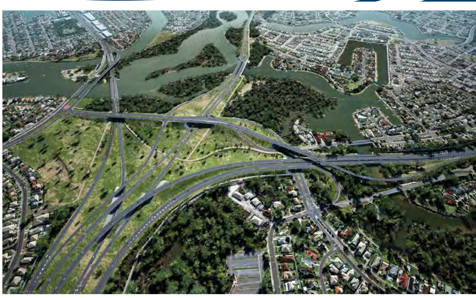
Artist's impression: Mooloolah River Interchange (Mooloolaba to the left)

13 QGOV (13 74 68) www.tmr.qld.gov.au | www.qld.gov.au