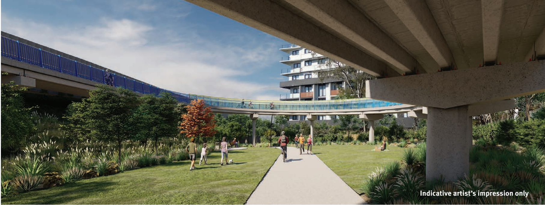
Indicative artist's impression only