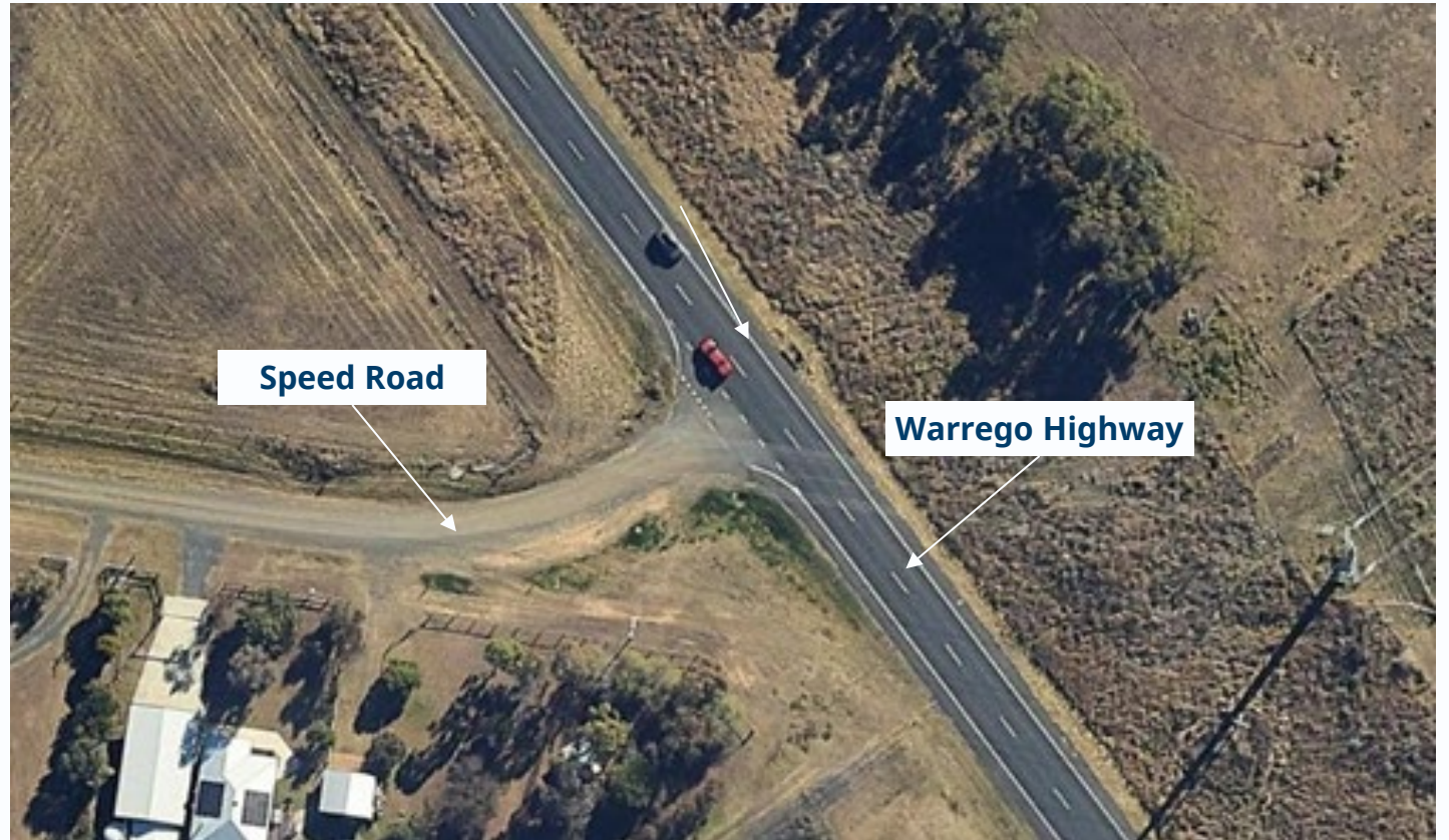
Warrego Highway and Speed Road intersection, near Oakey