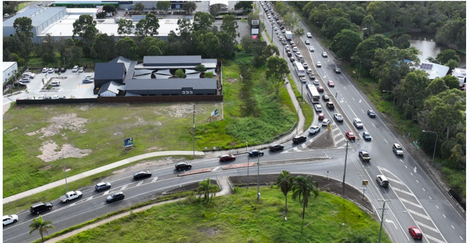
Intersection of Pialba - Burrum Heads Road and Maryborough - Hervey Bay Road looking west towards Burrum Heads