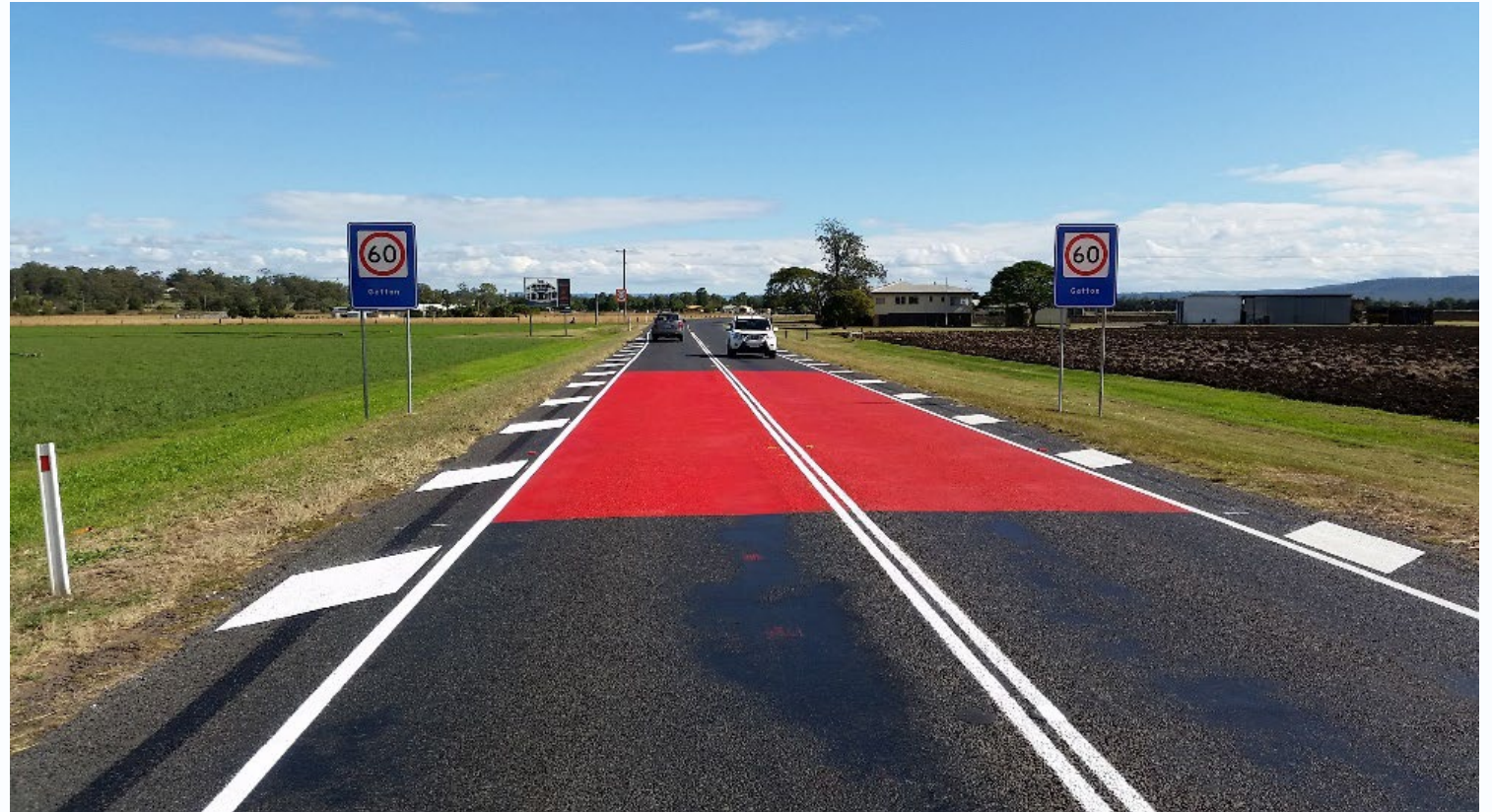
Gatton township entry safety treatment on Eastern Drive