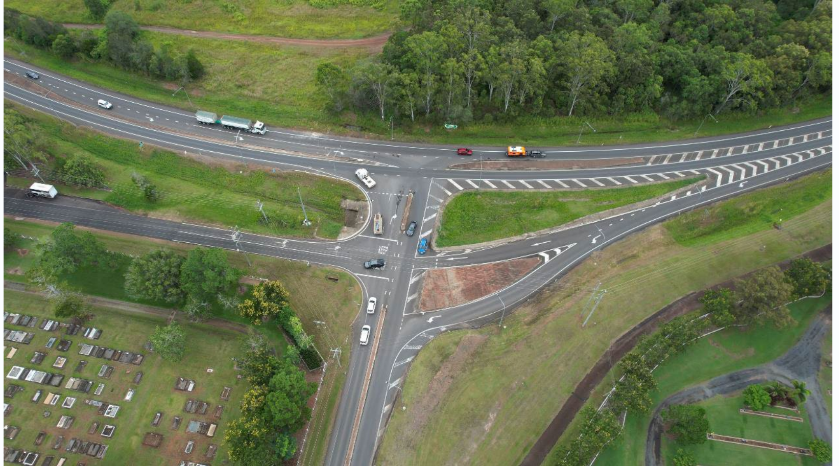
Bruce Highway (Maryborough – Gin Gin), Walker Street, upgrade intersection