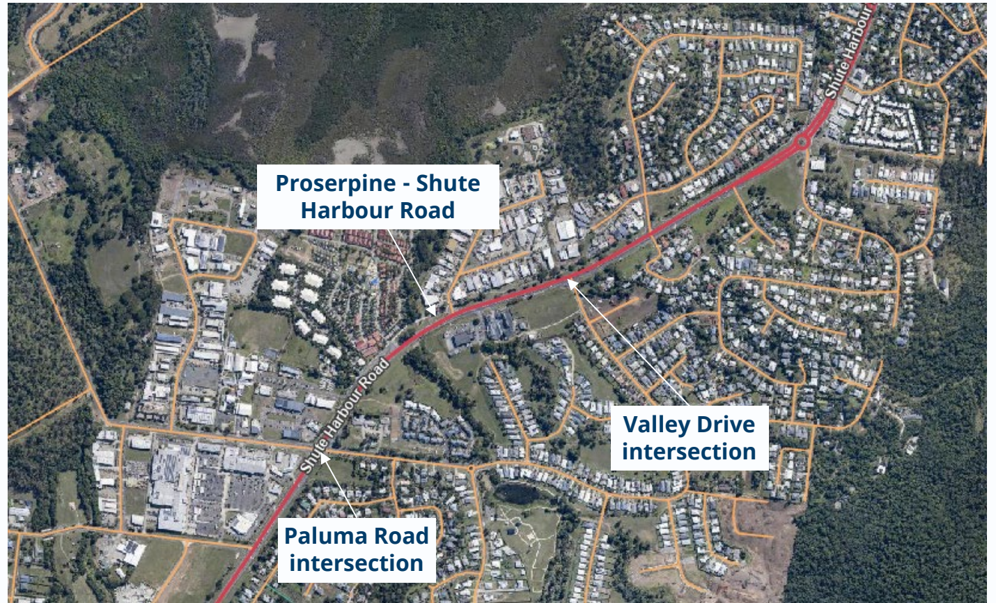
Proserpine - Shute Harbour Road packaged works indicative locality map