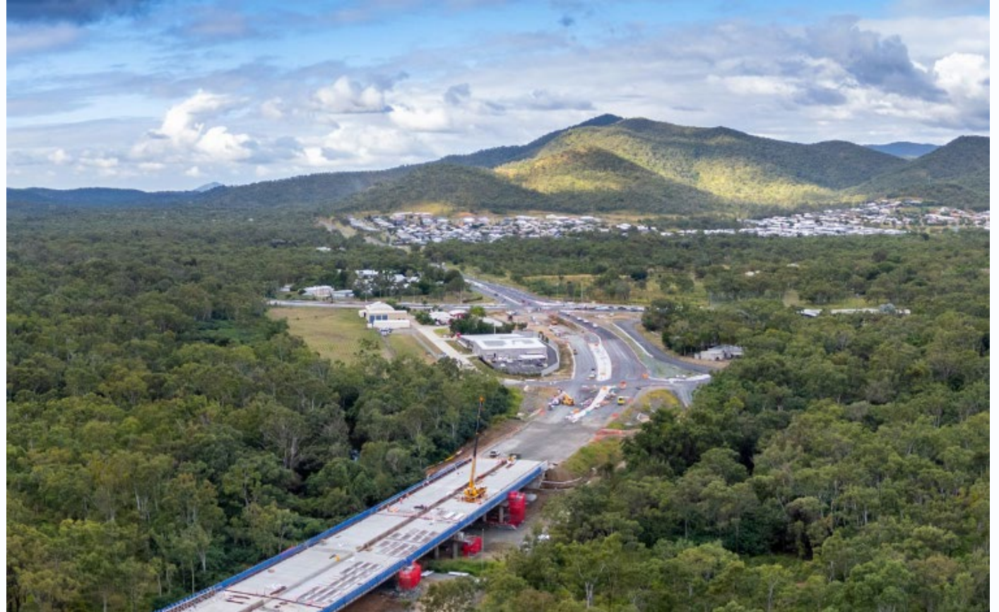
Rockhampton Ring Road, construction of new Limestone Creek Bridge