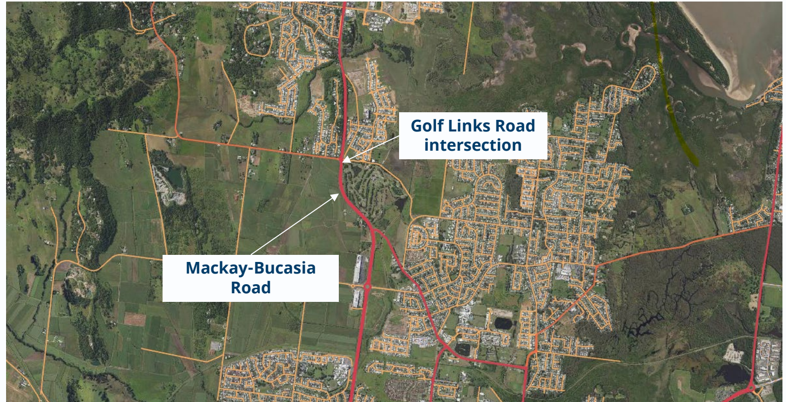
Mackay-Bucasia Road and Golf Links Road intersection indicative locality map