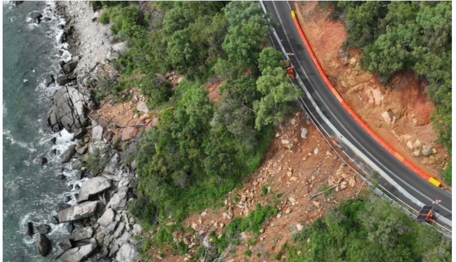
Damage on Captain Cook Highway