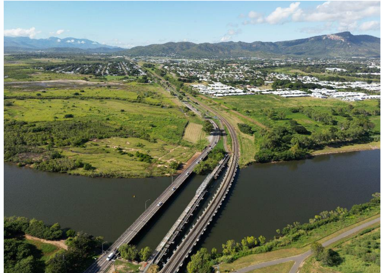
South Townsville Road, Rooney's bridge