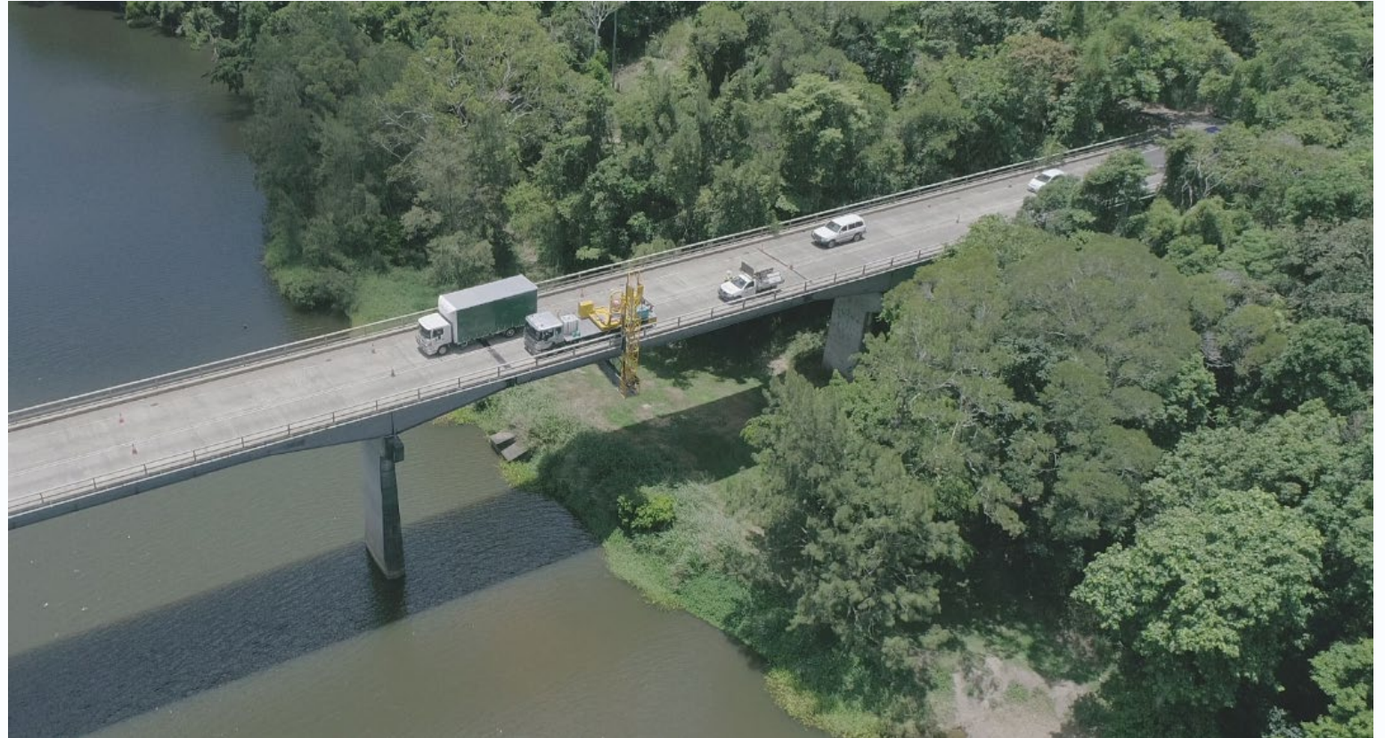
Kennedy Highway (Cairns - Mareeba), Barron River bridge