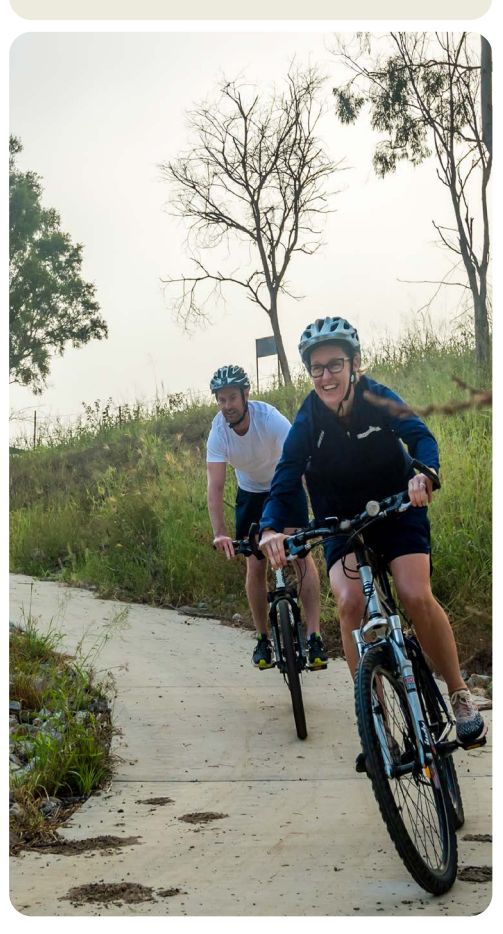
Keen to know more? Visit tmr.qld.gov.au/BVRT