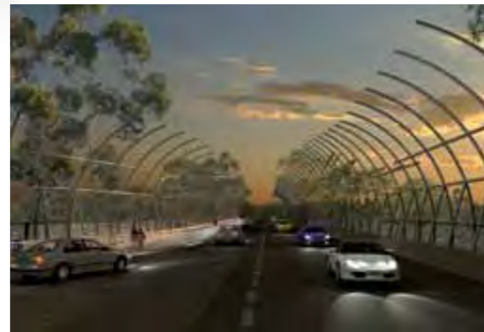
Artist's impression of Henry Ellerton Bridge, the new bridge linking Old Logan Road to Wilruna Street