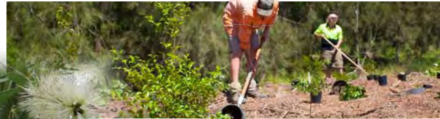
Revegetation works underway near Woogaroo Creek

Woogaroo Creek is an important and diverse waterway, with a history of deep environmental significance. While working in the area, the project team identified that vegetation around Woogaroo Creek was highly disturbed and dominated by pest species of plants resulting in a loss of environmental value and diversity. Plants including Lomandra, White Bottle Brush and Deep Yellow Wood have been used in the revegetation.