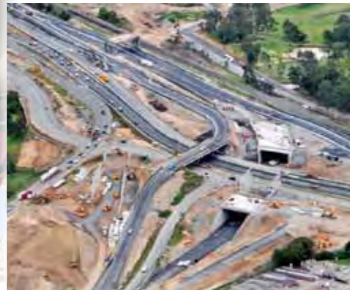
Works underway August 2008