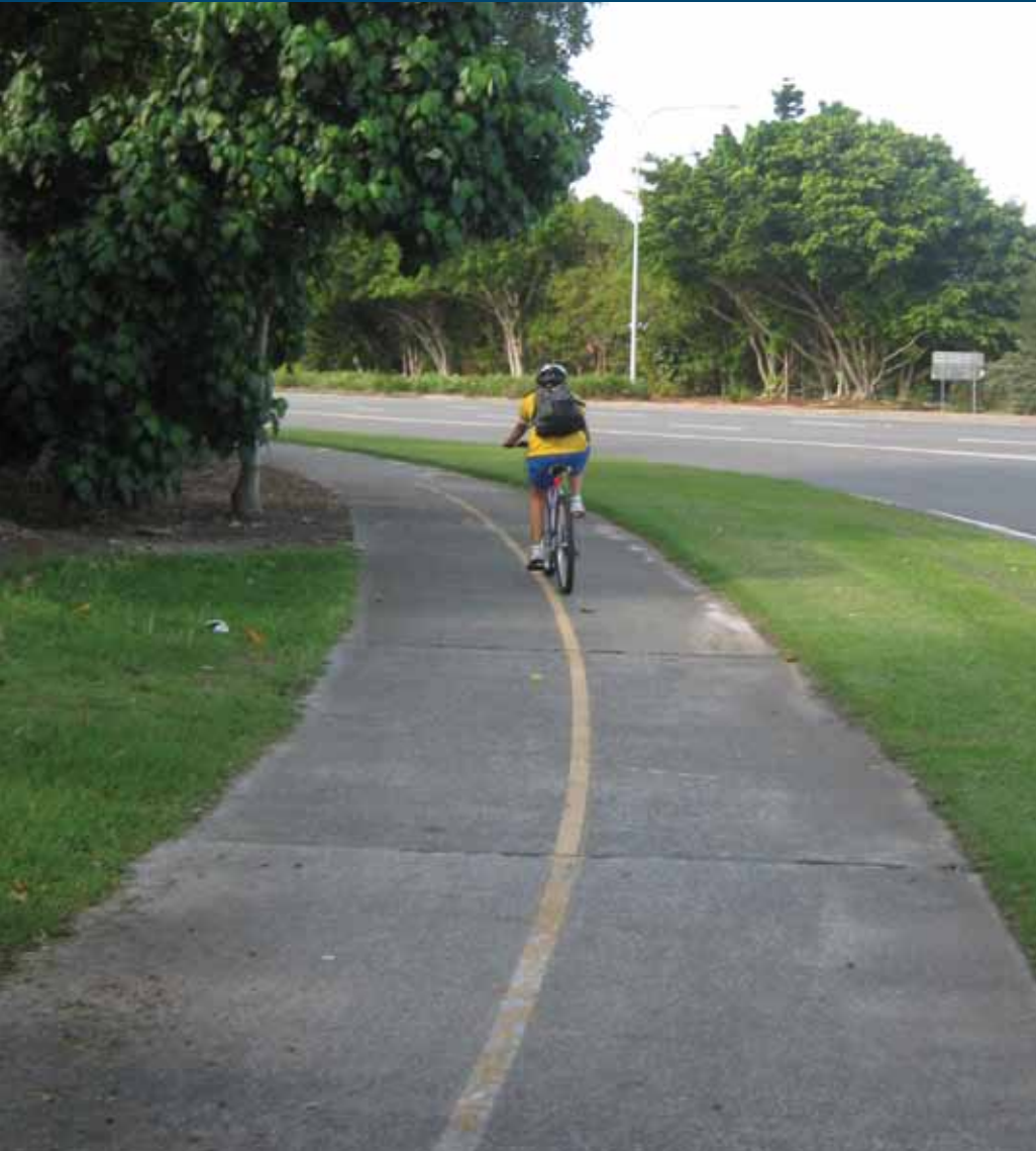
Off-road shared cycle and pedestrian path.