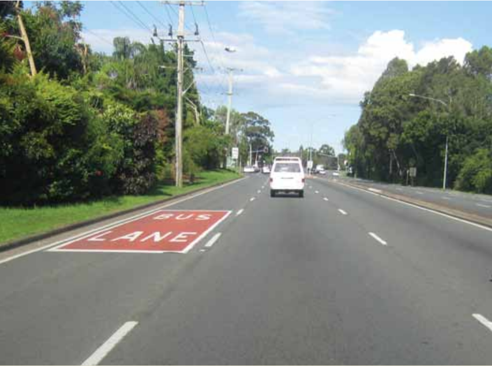
Dedicated bus lanes on Nerang-Broadbeach Road.