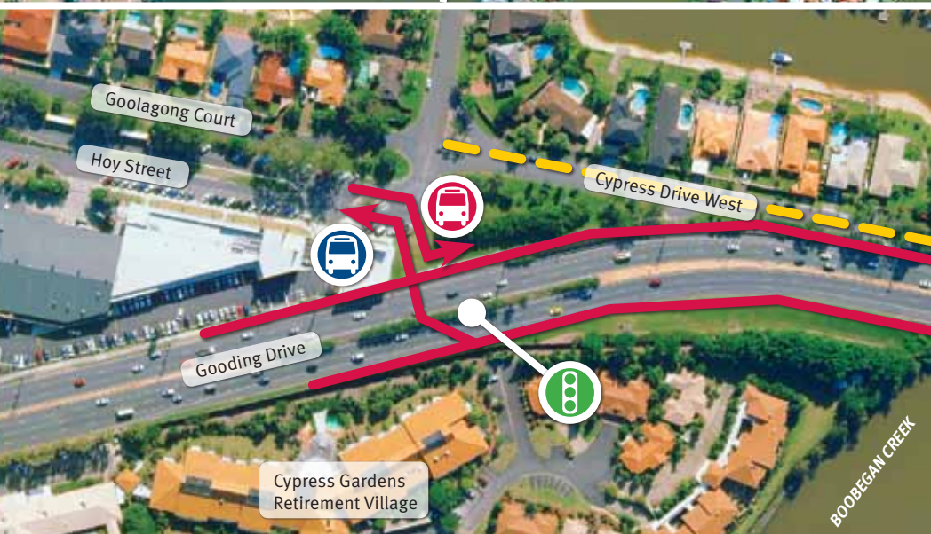
Bus priority improvements at Hoy Street