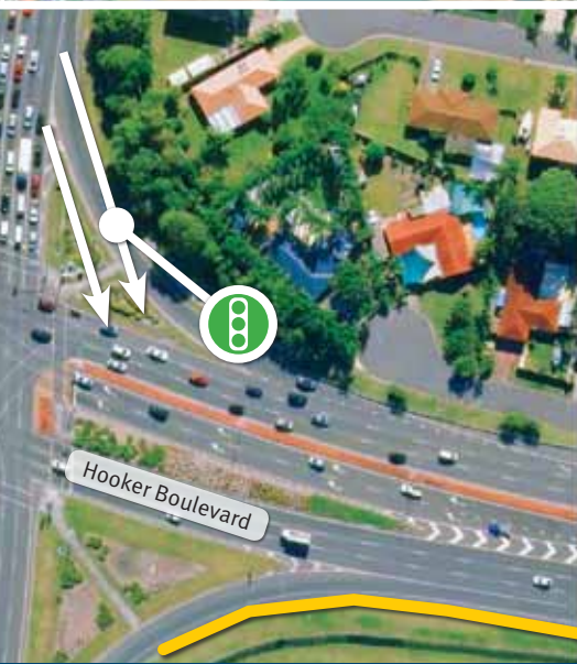
lanes at Bermuda Street