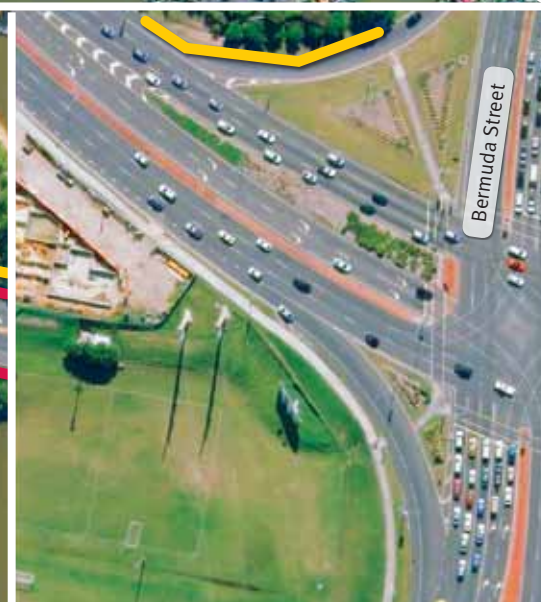
Signalised dual left turn