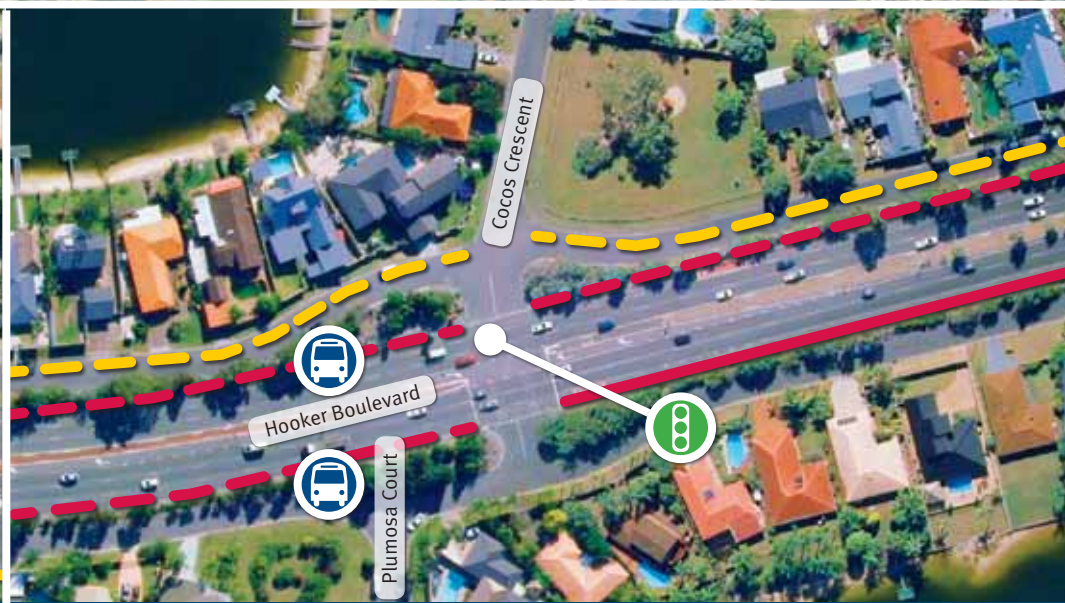
Intersection improvements at Cocos Crescent