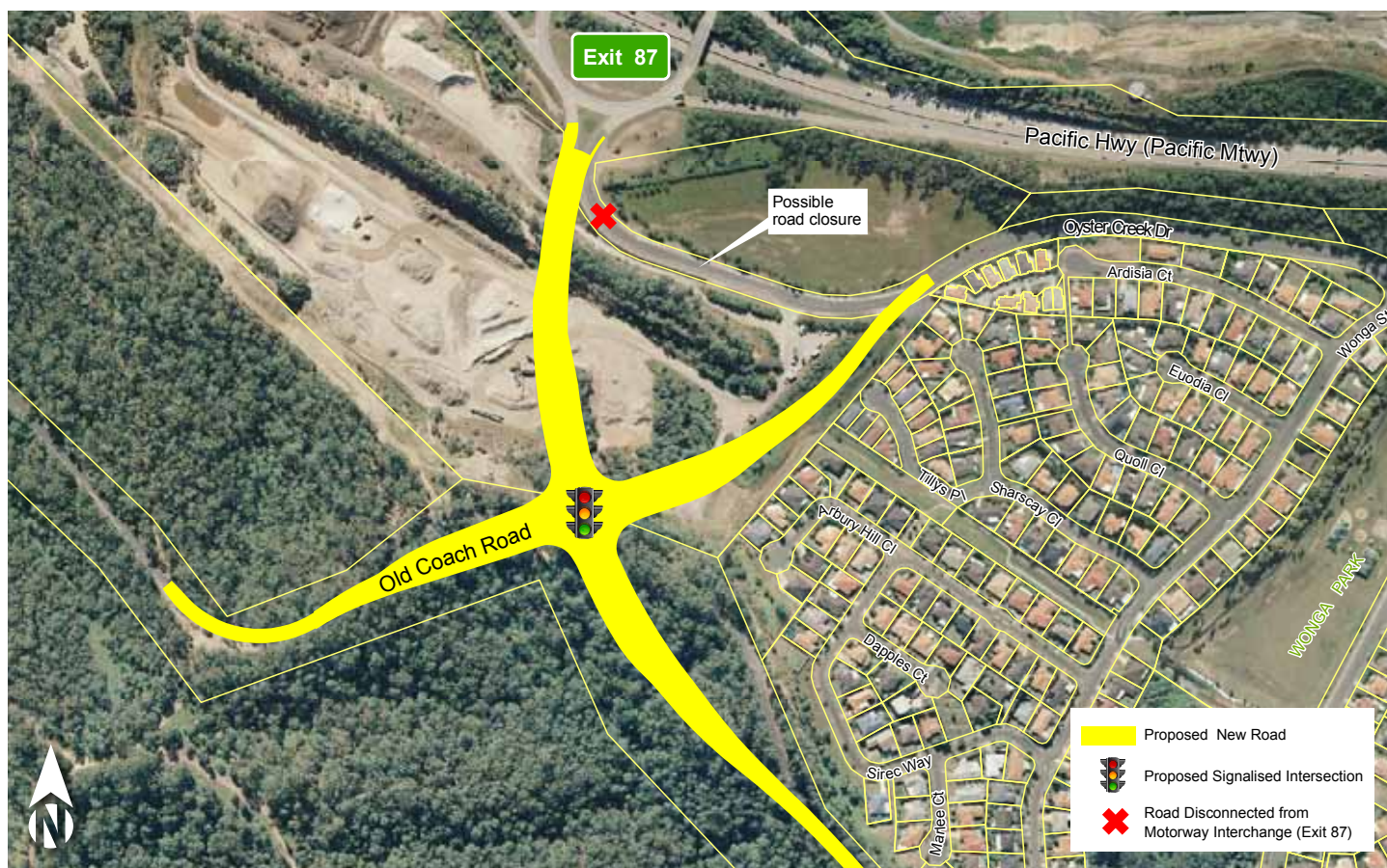
Old Coach Road Connector proposal