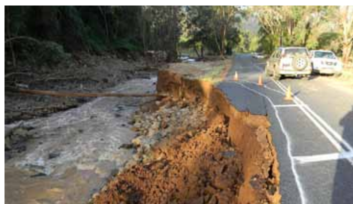
Flood damage on Murphys Creek Road

The reconstruction works will be undertaken throughout the Lockyer Valley and Ipswich regions within the next three years.