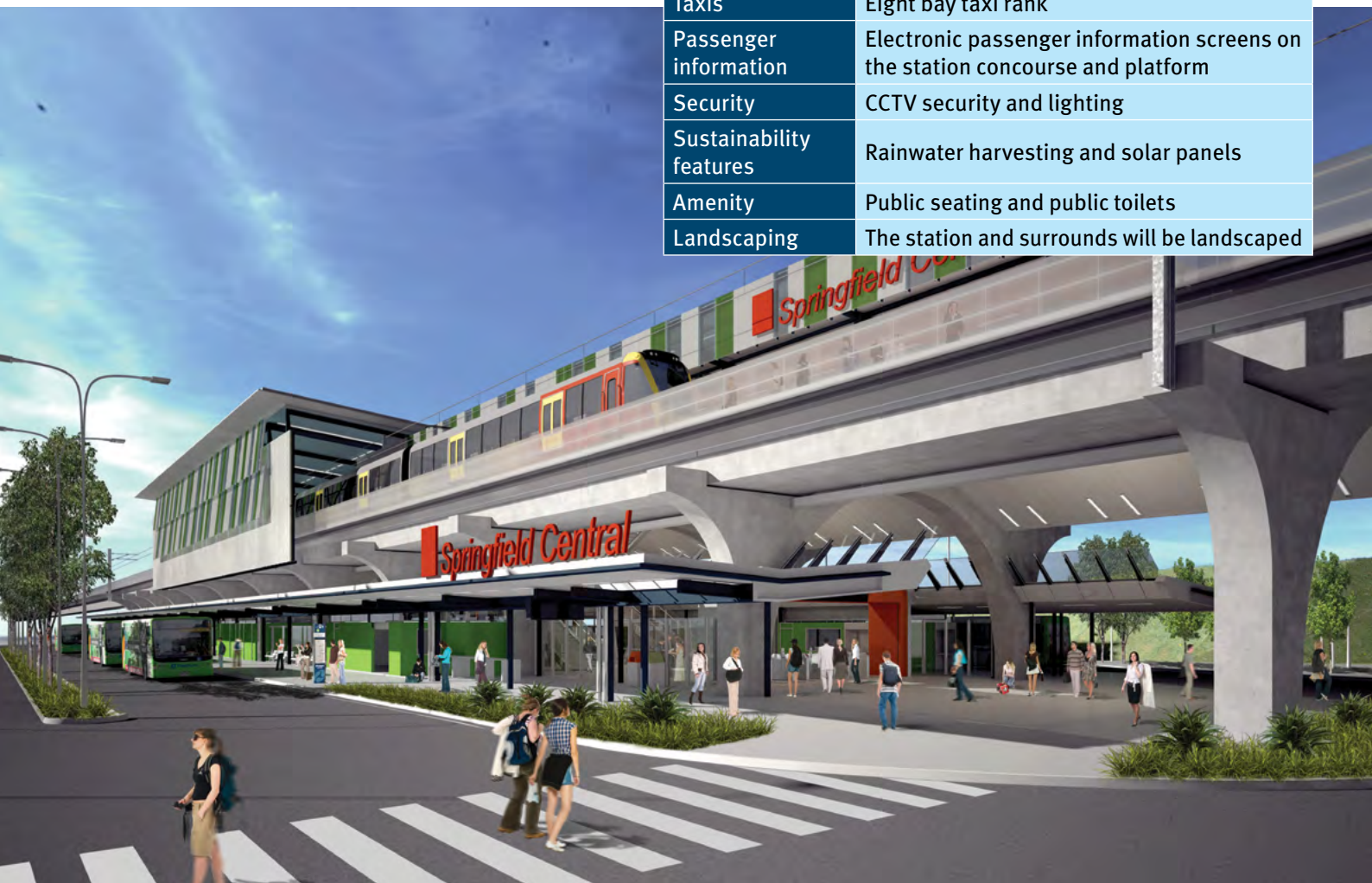
Artist's impression Springfield Central Station.