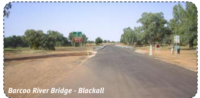
Barcoo River Bridge - Blackall

An additional overtaking opportunity will be built on the Morney-Birdsville Road starting at the Morney intersection. As local governments are the primary suppliers of road construction and maintenance to Main Roads in the Central West, we will be working closely with the new Regional Councils to ensure a smooth transition and continuation of our program delivery.