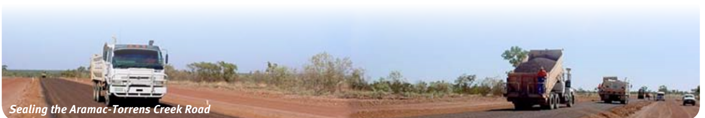
Sealing the Aramac-Torrens Creek Road