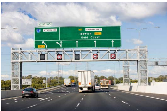
Gateway Motorway - Wynnum Road exit

Gateway Upgrade Project Team on 1800 700 525 Email enquiries@gatewayupgradeproject.com.au