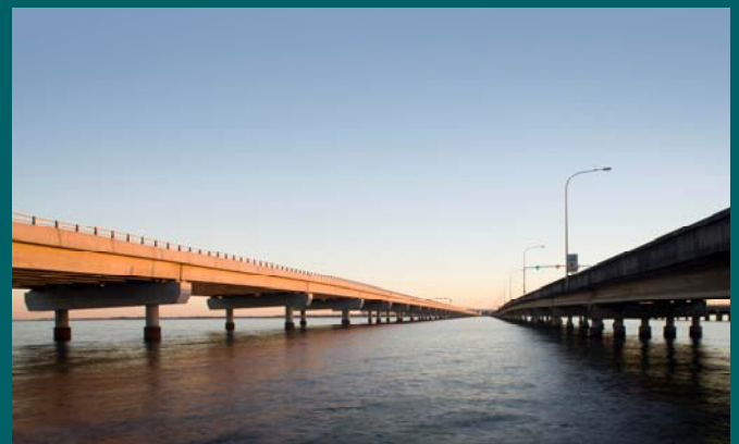
The new 2.7 kilometre Ted Smout Memorial Bridge provides a vital transport link between Brighton and Clontarf

Always stay behind the safety line when waiting for a train and only cross railway lines using signalised level crossings, overhead footbridges, tunnels or subways.