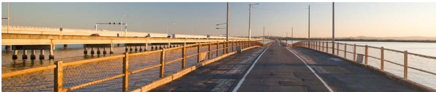
The old Hornibrook Highway bridge between Brighton and Clontarf