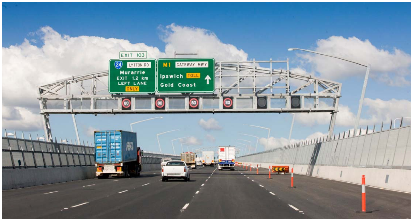
The new Sir Leo Hielscher Bridge was opened to traffic on Sunday 23 May 2010

Phone: 1800 636 896 Email: wbttni@tmr.qld.gov.au