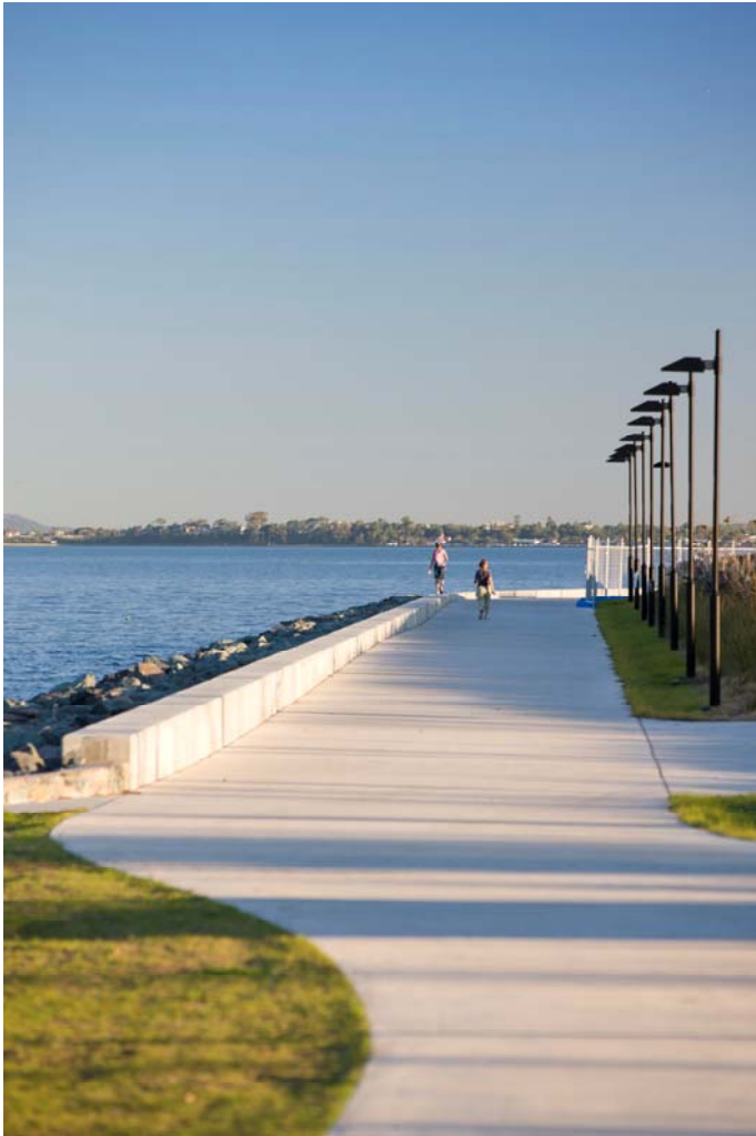
New footpaths and lighting have been installed adjacent to the Ted Smout Memorial Bridge

Take up the challenge to walk the bridge between 8.30am and 2.30pm by registering at www.tmr.qld.gov.au/tedsmout . If you would like to watch the official commissioning in the centre of the bridge at 9am, you must register to walk the bridge between 8.30am and 9.30am.