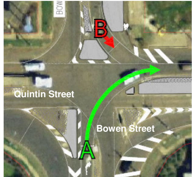
Photo: intersection of Bowen and Quintin streets, Roma