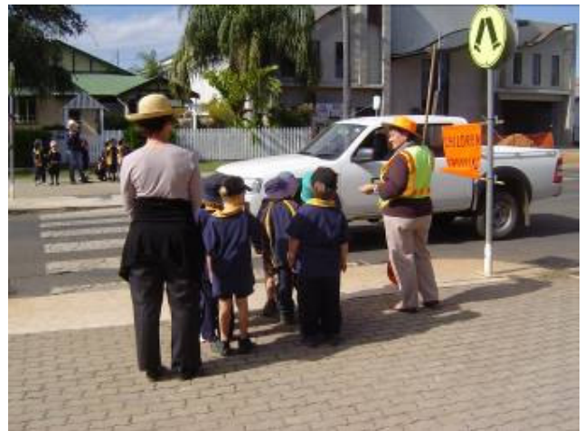
Photo: A crossing supervisor helping school children.

For more information contact the Department of Transport and Main Roads Road Safety Officer on 4622 9541.