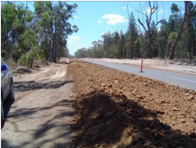
Photo: Widening of the Carnarvon Highway

The project undertaken by RoadTek, involves improving the intersection of Fairview Road and the Carnarvon Highway and replacing 14 culverts to improve drainage.