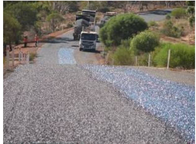
Photo: Contractors resealing roads in south west Queensland

This process helps to prevent cracking, maintain a watertight seal over the roads and provide a suitable surface for tyres to grip the road.