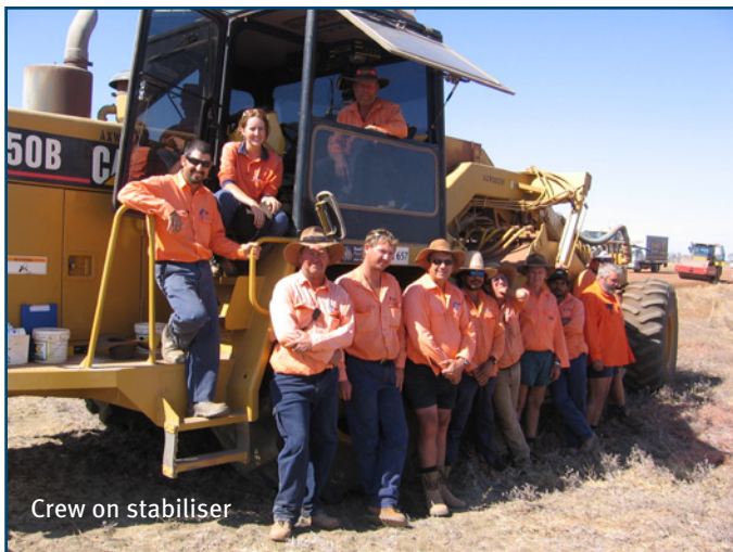
Crew on stabiliser