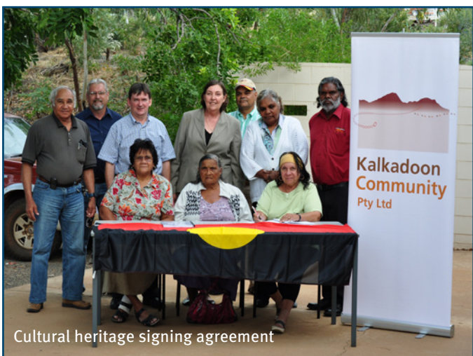
Cultural heritage signing agreement