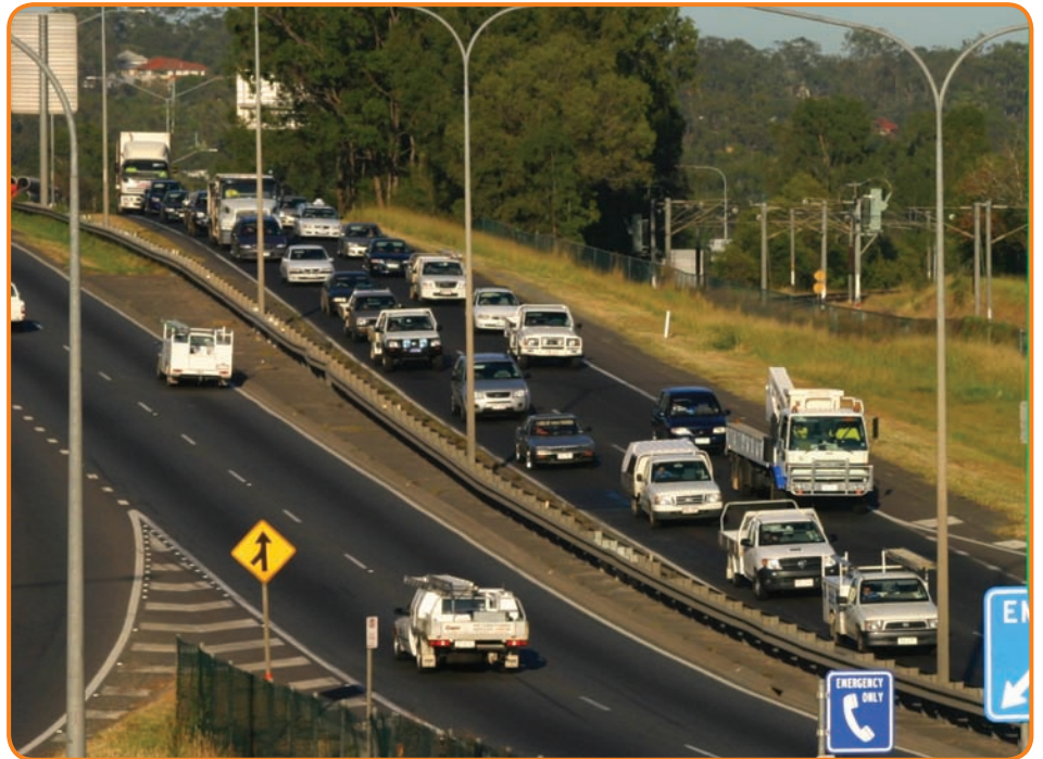
Traffic demands are increasing in the Western Corridor.

South east Queensland's population is projected to grow by over one million people in the next two decades. The Australian and Queensland Governments have agreed on the way forward for increasing the capacity of the Ipswich Motorway to meet projected traffic demands in this growth corridor. It's also important that the motorway serve its function in moving freight efficiently from interstate and other parts of Queensland to Brisbane and the port of Fisherman Island.