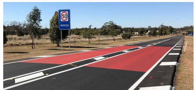
Warrego Highway - Morven

TMR uses this treatment for cycleways, bus lanes, threshold treatments for schools, wildlife conservation areas and township entry treatments.