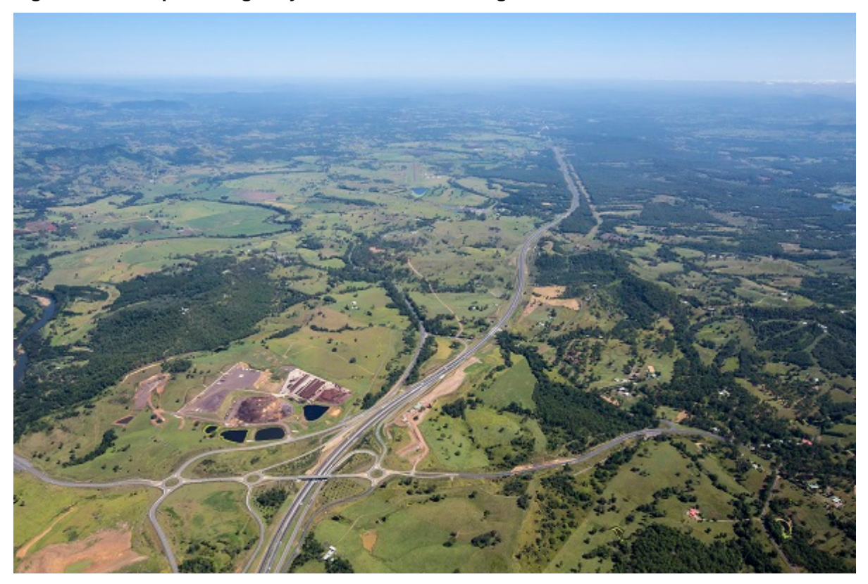
Figure 3 Completed Highway - Looking north to Woondum Interchange