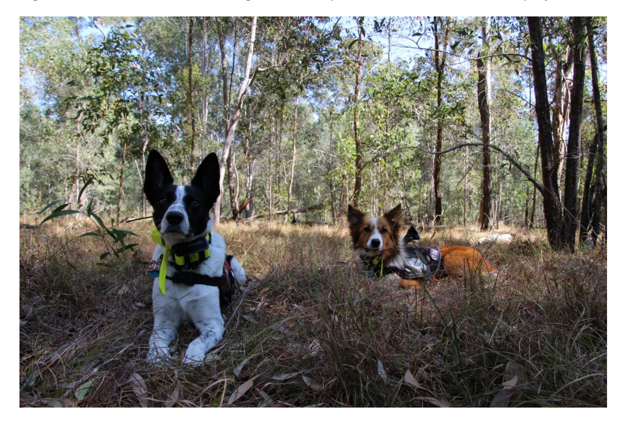
Figure 4 Koala scat detection dogs trained as part of the Section C research project