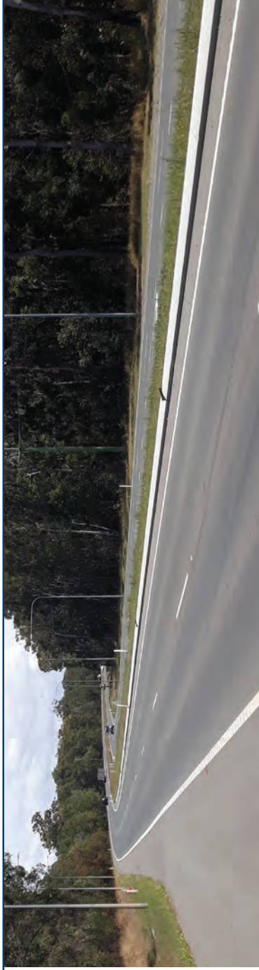
An existing 4-lane median divided section of Bribie Island Road