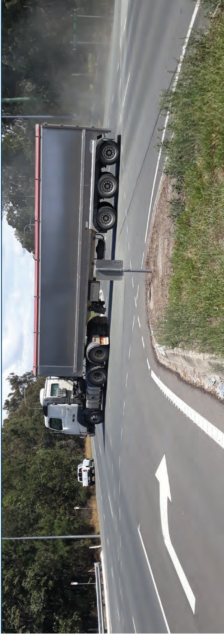
Heavy vehicle turning out of a 'Give Way' controlled side street in 100 km/h section of Bribie Island Road.