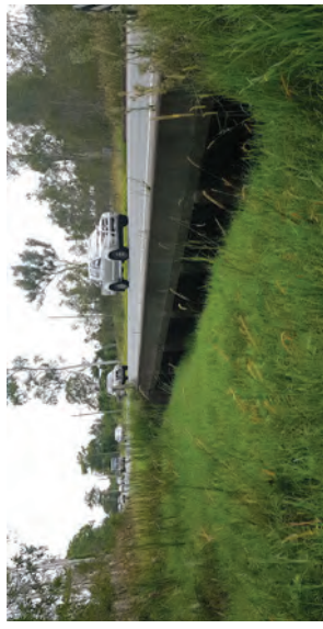
King Johns Creek – existing culverts have low flood immunity