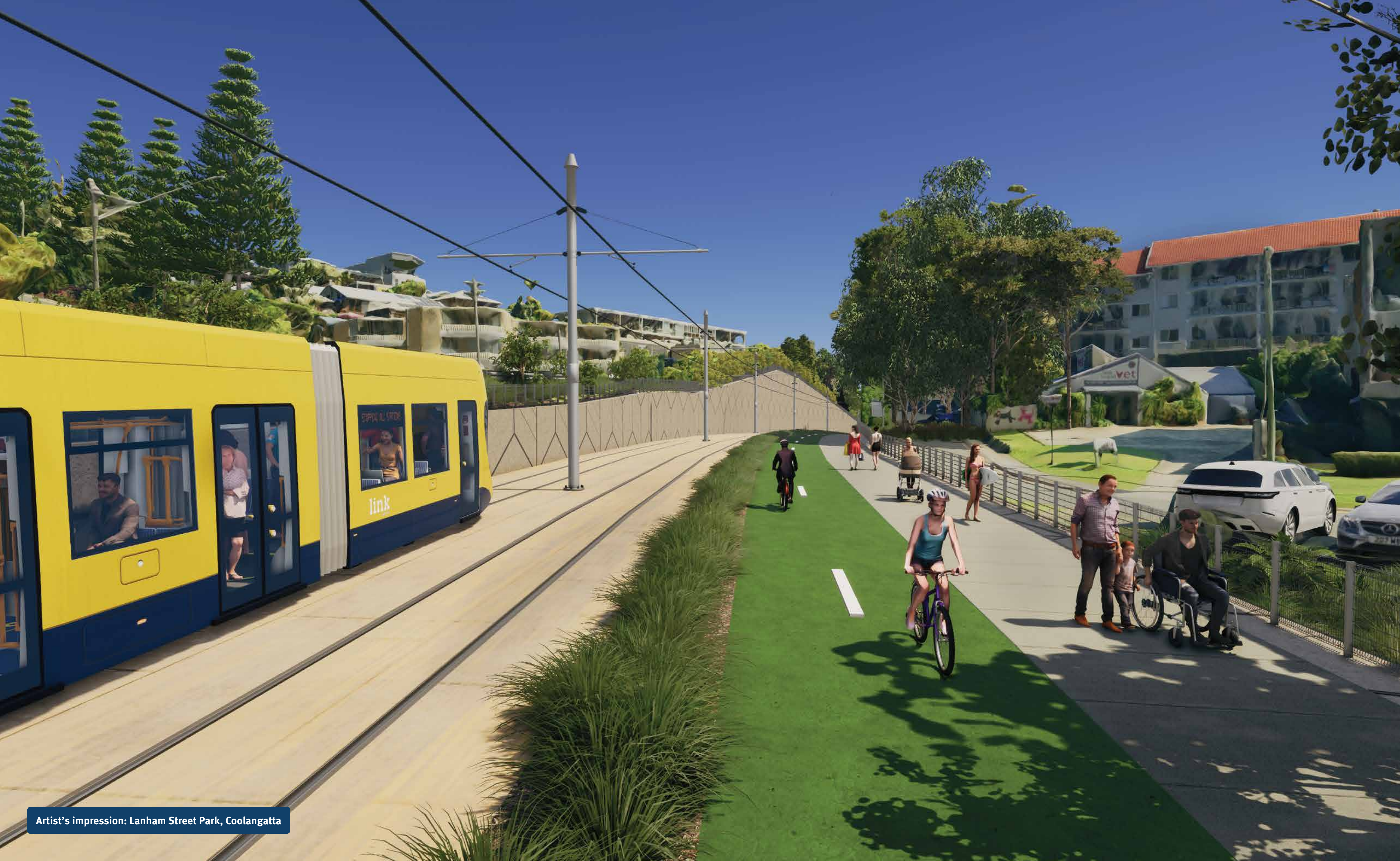
Artist's impression: Lanham Street Park, Coolangatta